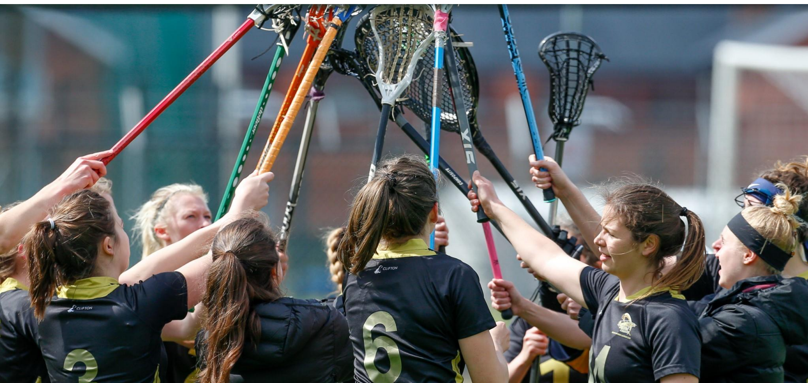
Bristol Bombers, National Club Championships