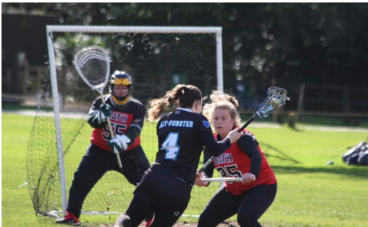
Bath Ladies Lacrosse and Cheltenham Cougars