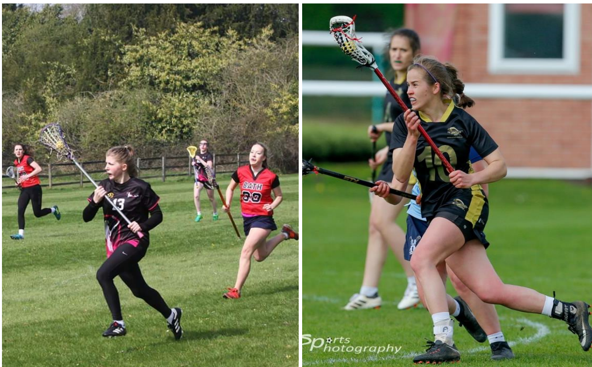
Southampton Ladies Lacrosse and Bath Ladies Lacrosse; Bristol Bombers