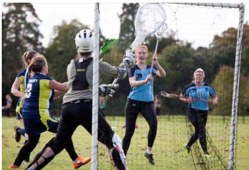
Birmingham Ladies Lacrosse and Oxford City Lacrosse

South West Development Cup: £35 per tournament; £70 for both development tournaments + Indoor