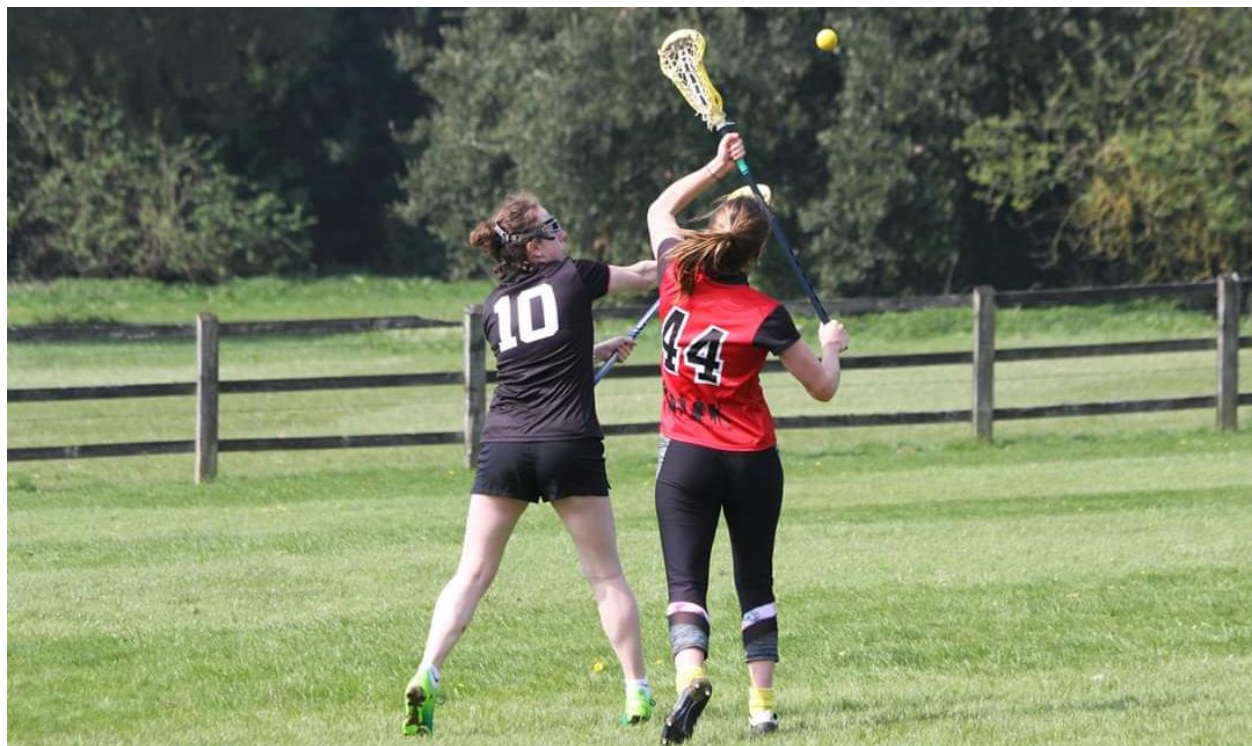
Southampton Ladies Lacrosse and Bath Ladies Lacrosse